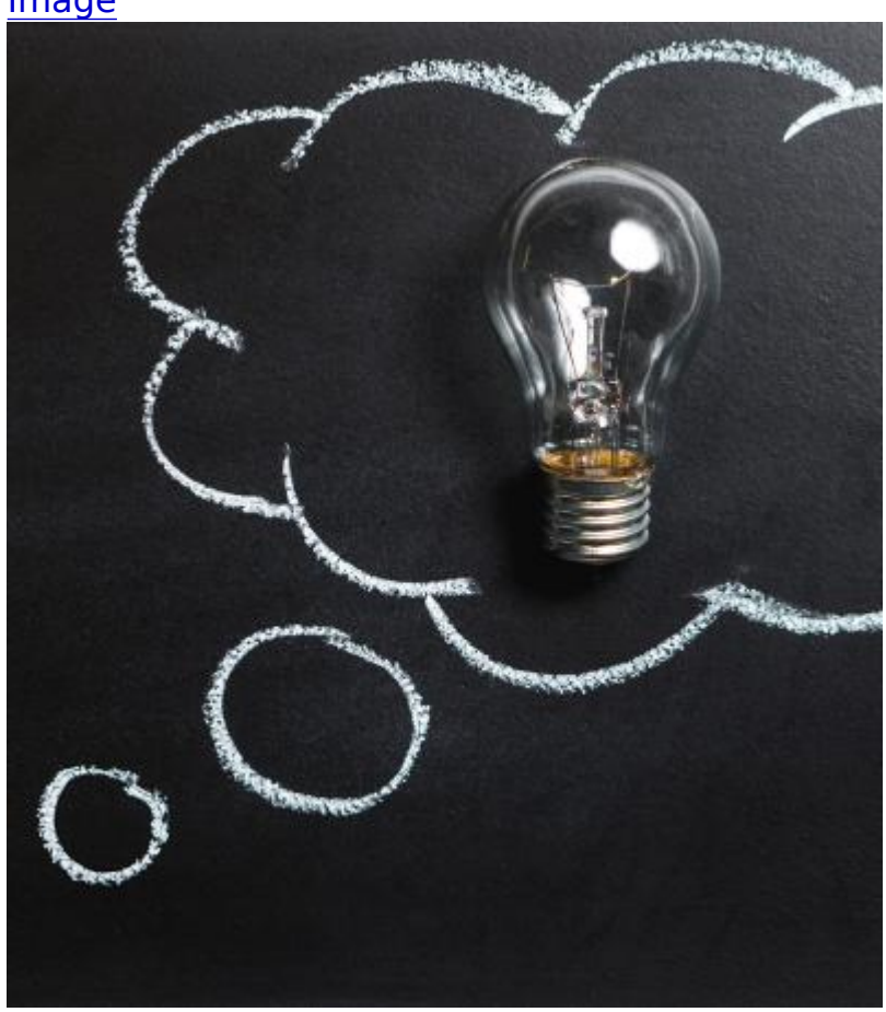
Create a Vision Board