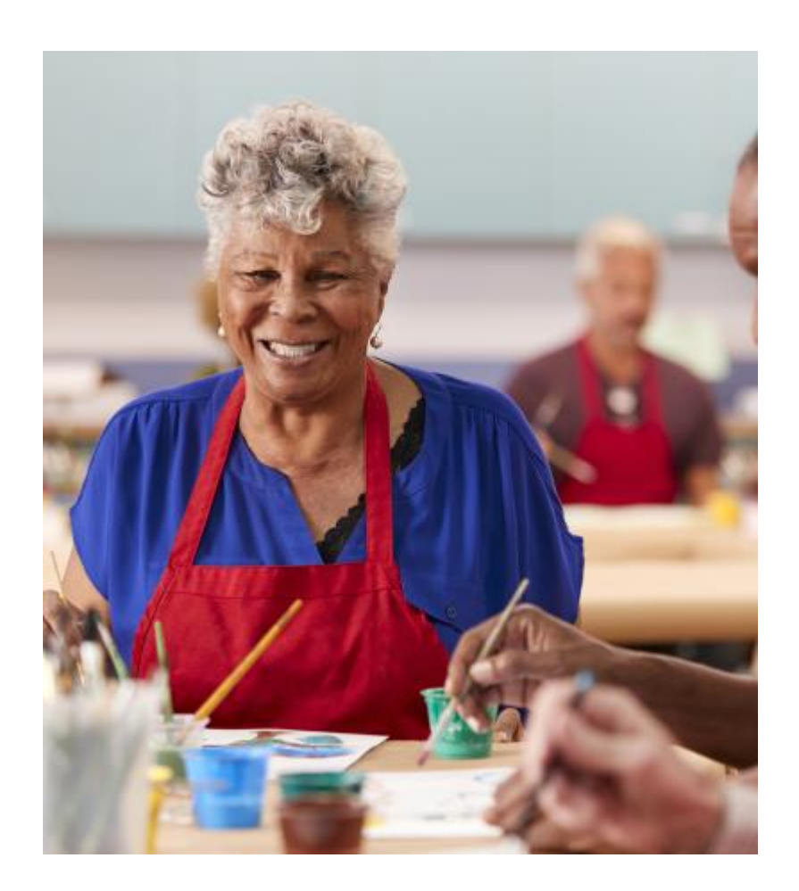
In Creative Company: Art Classes for Older Adults