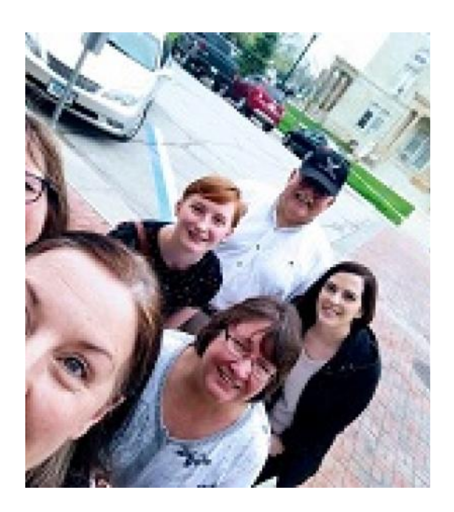
Wellness Wednesdays in Winterset: Lunch & Learns and More!

Mar 2, 2016 Intergenerational+ | $$$ Image