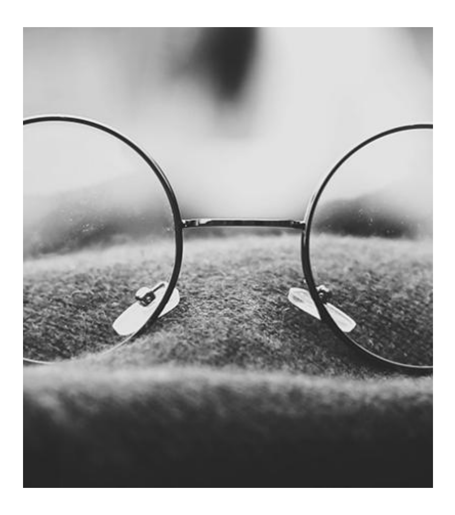
Magic for Muggles