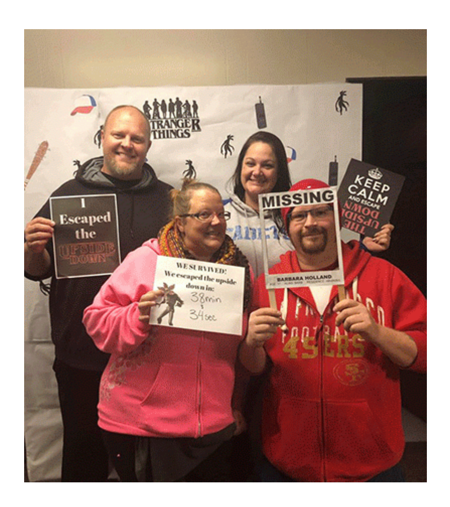
Hosting a 'Stranger Things' Escape Room

Audience Teens (13-16) Adults (21 and up) Sep 9, 2016 Children (9 and under)+ | $$$ Image