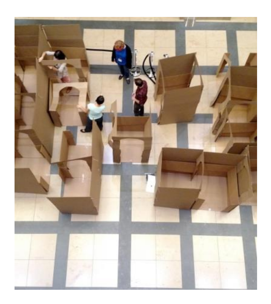
Giant Harry Potter Cardboard Maze

Children (9 and under) Nov 3, 2017 Teens (13-16)+ | $ <u>Image</u>