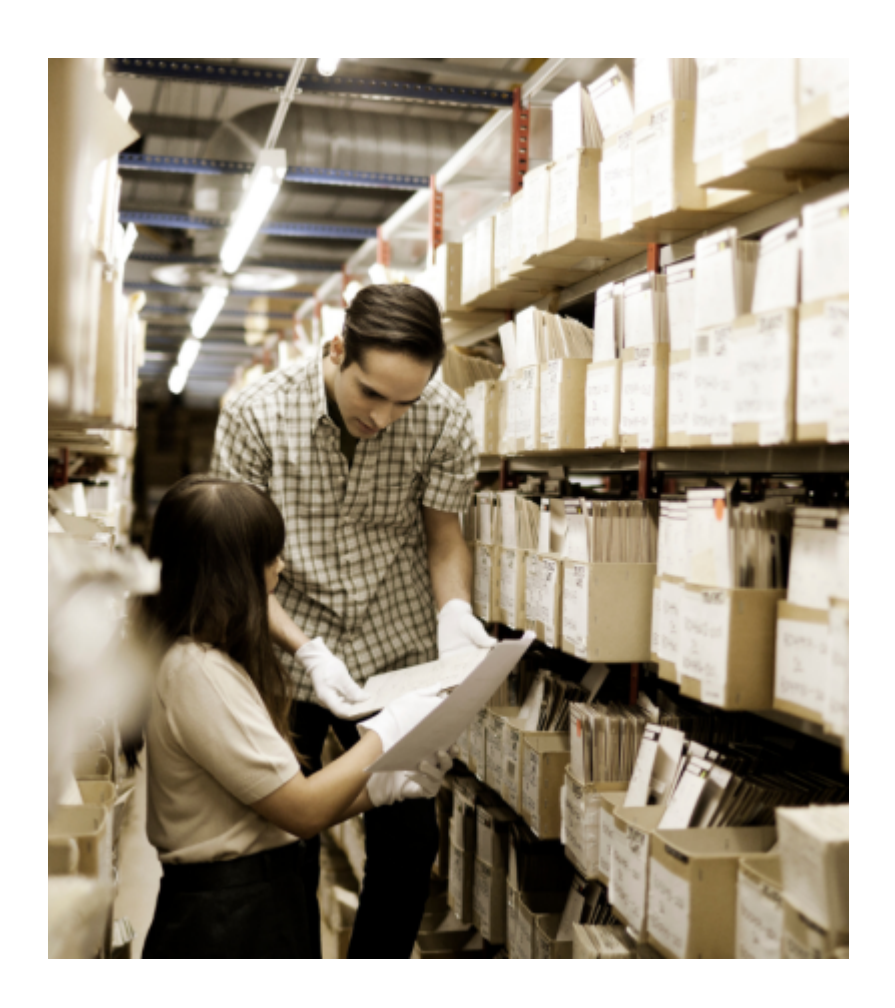
Analyzing Primary Sources for Program Planning