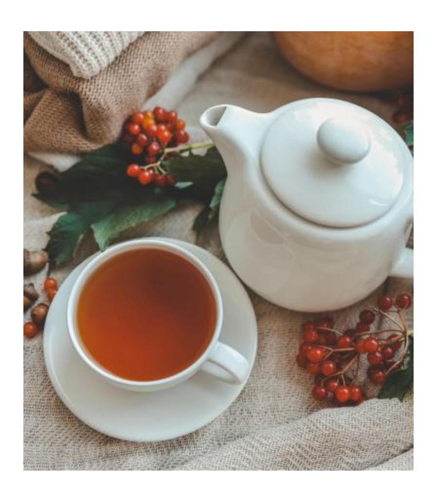
Bridgerton High Tea