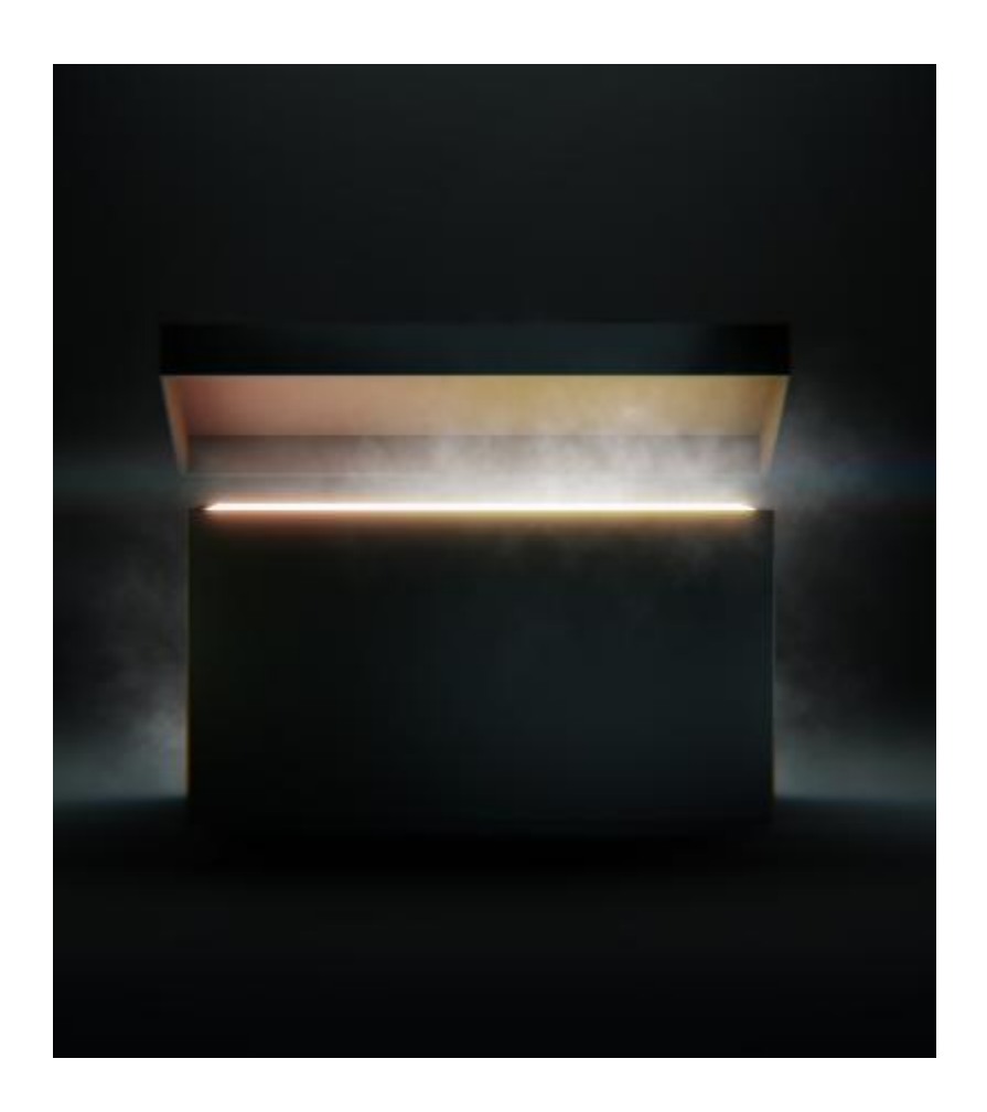
Mysterious Benedict Society Adventure