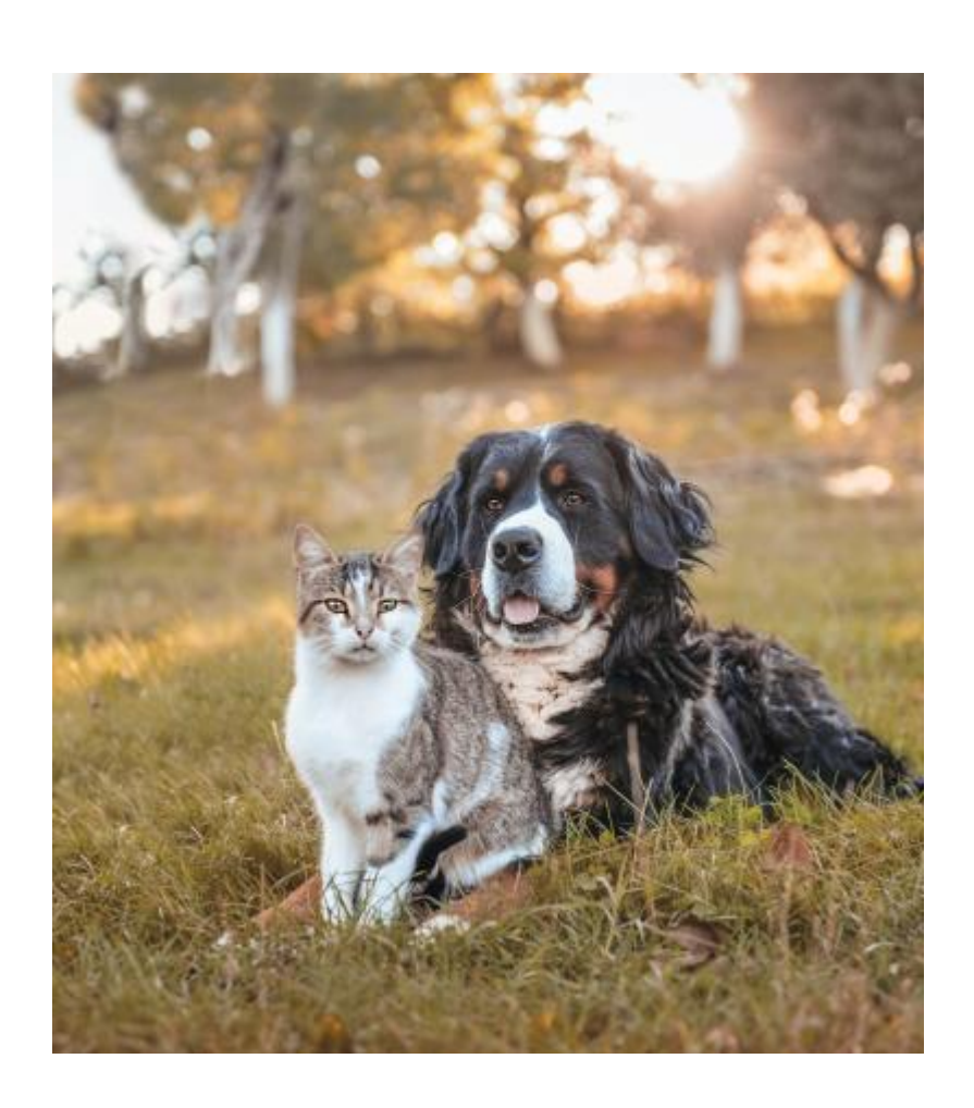
Finals Week Pet Grams