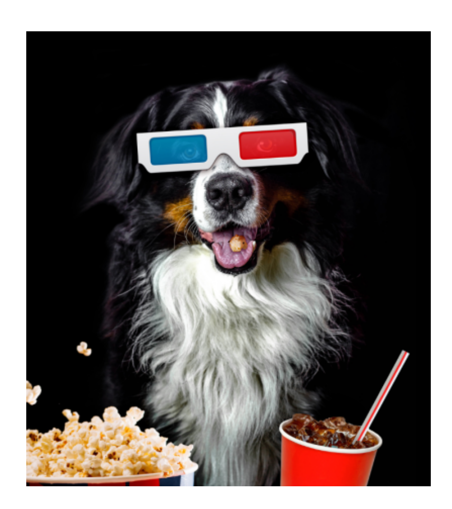
Dog Friendly Movie Matinee