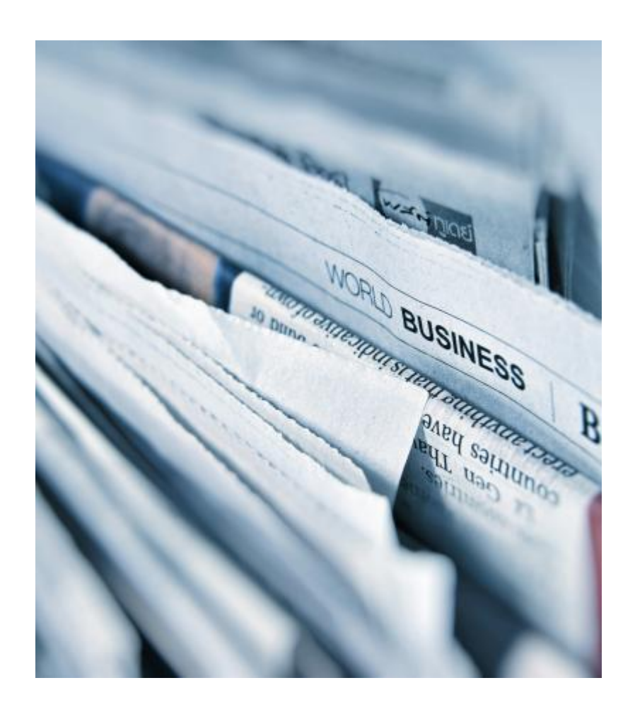
Arts Programming in a Public Library, Part I