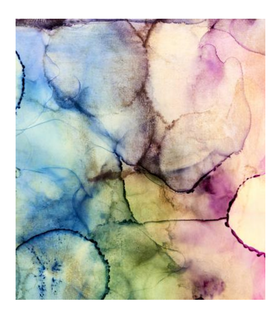
Ink Floating for Teens