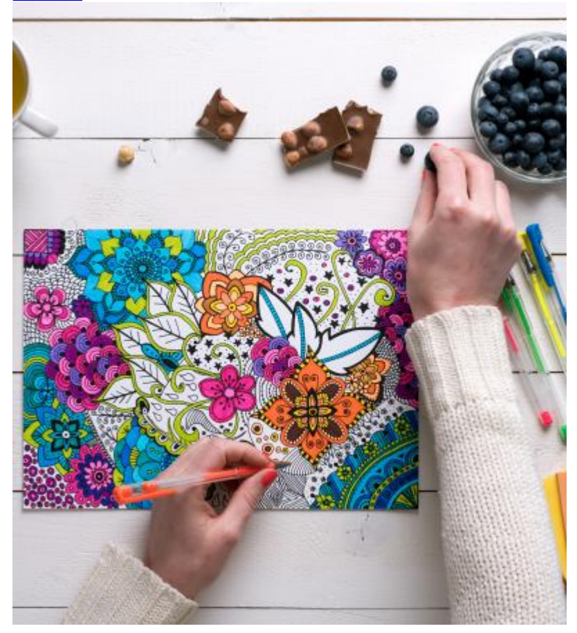
Inside the Lines Coloring Club