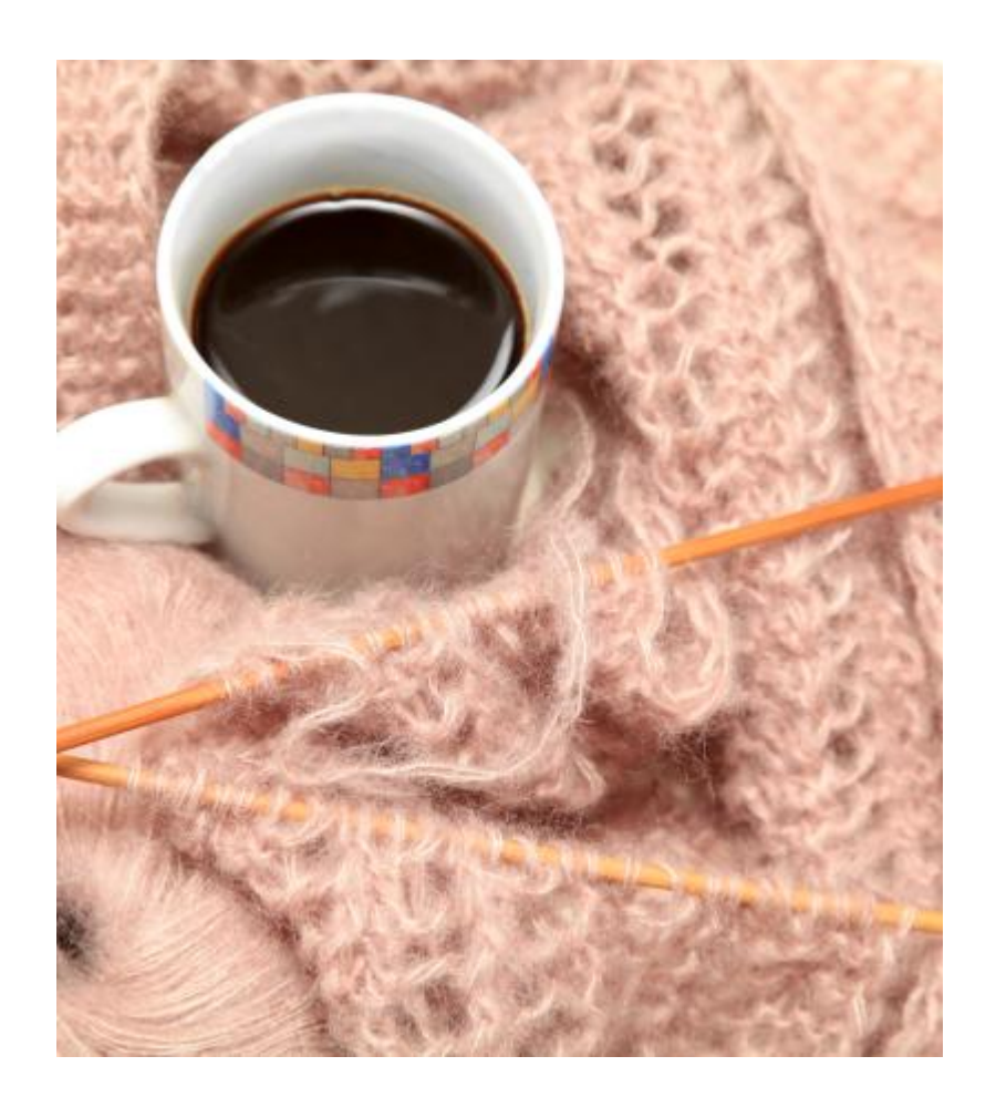
Chillin': Crafting it up with Cappuccinos