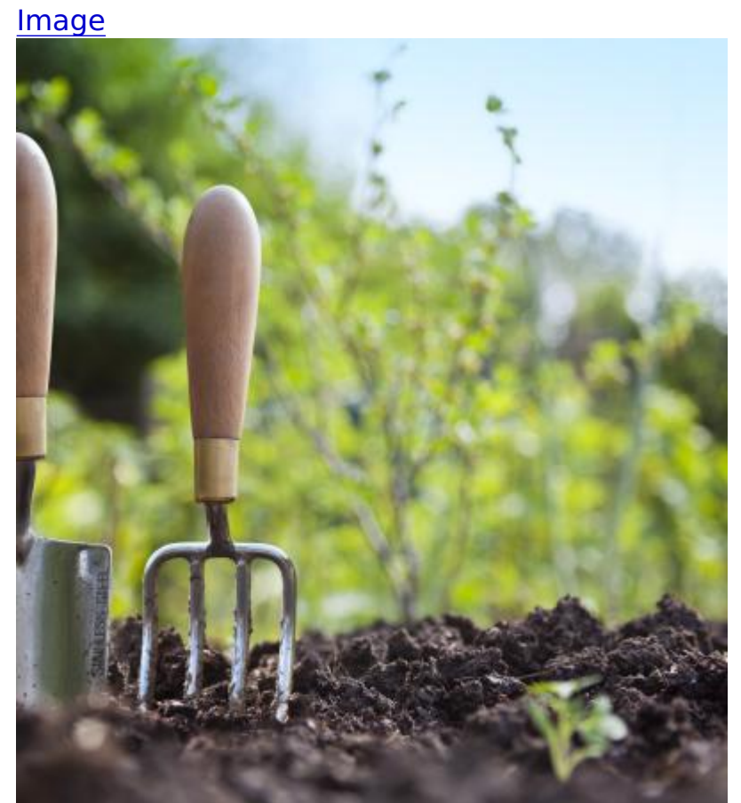
Get Started Gardening at Your Library