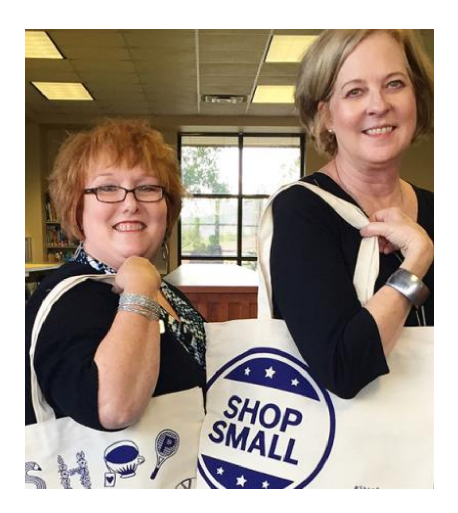
Small Business Saturday® - Shop Small®