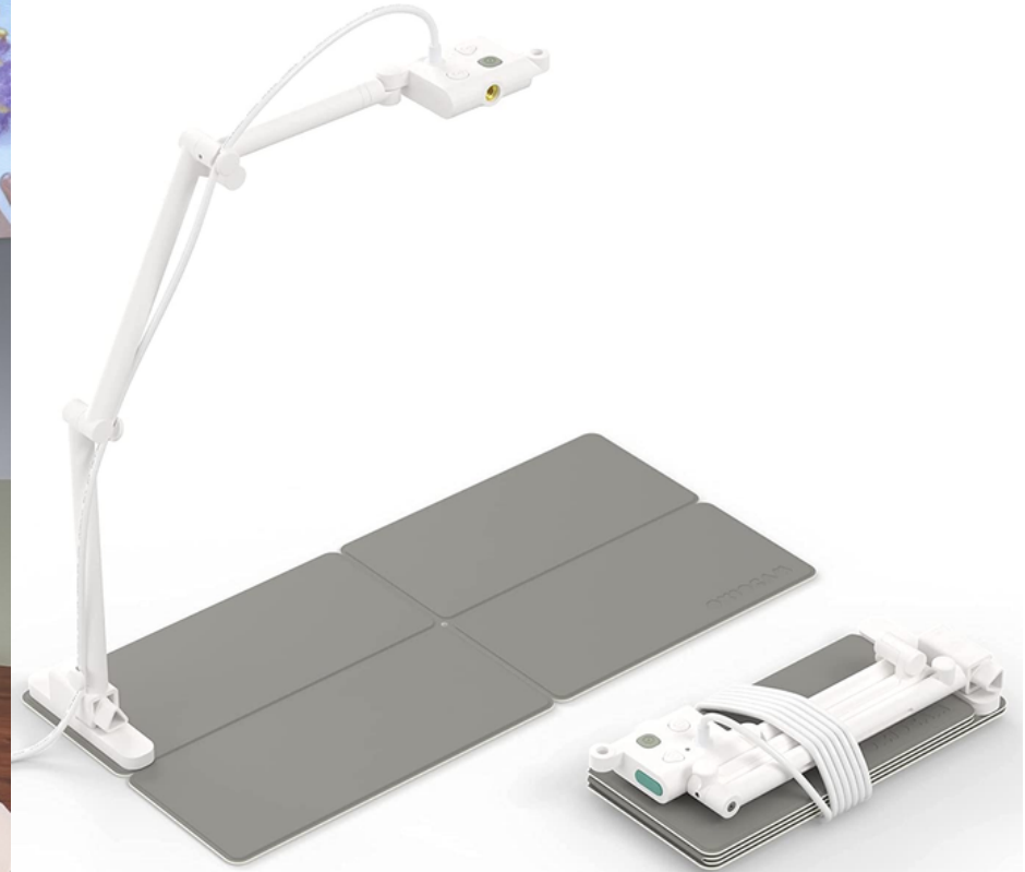
$58 OKIOLABS OKIOCAM S USB

Highly recommended! Overhead camera that provides a "birds eye view" of demonstrations