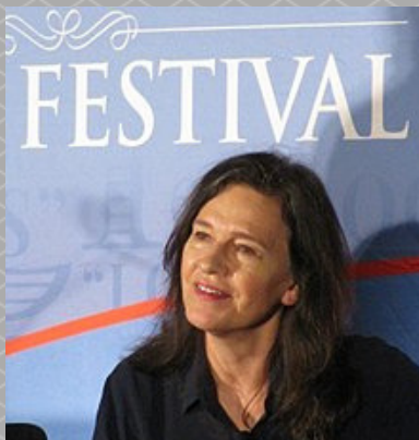
Louise Erdrich September 10