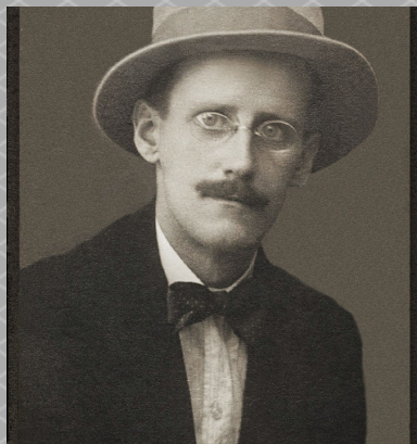
James Joyce March 12