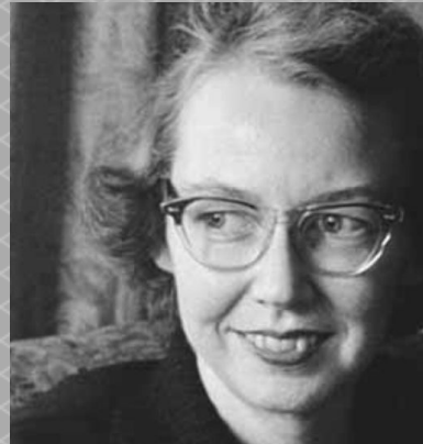
Flannery O'Connor May 14