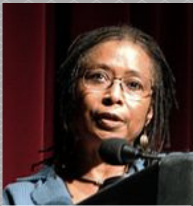
Alice Walker February 12