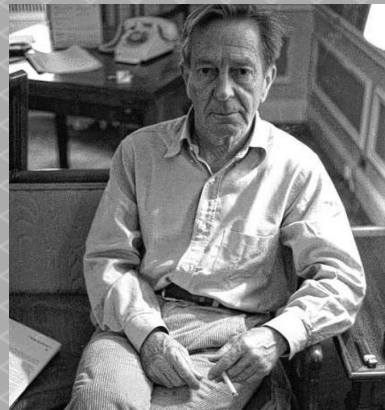
John Cheever June 11