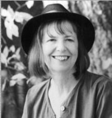
Bobbie Ann Mason December 10