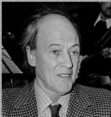
Roald Dahl August 13