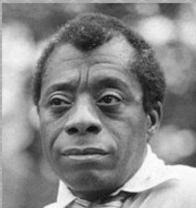
James Baldwin January 8