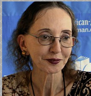
Joyce Carol Oates July 9