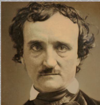
Edgar Allan Poe October 8