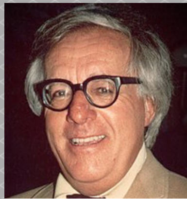
Ray Bradbury April 9