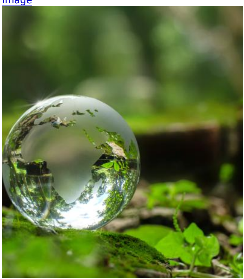
Earth Day Terrariums