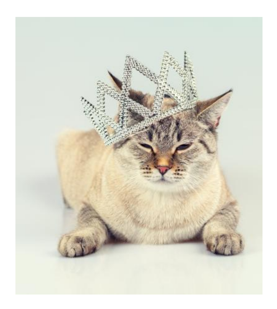
Build Your Cat a Castle