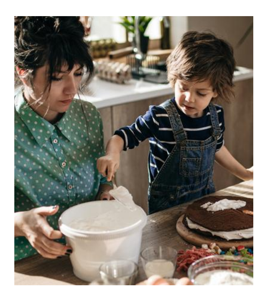
The Great Brookie Bake-Off (Online)