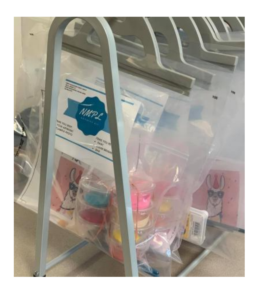
Curbside Kids' Activity Kits