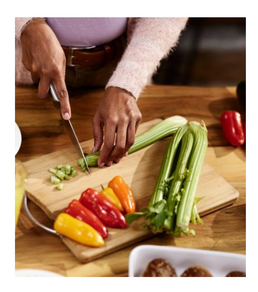
Cooking Matters® Online Grocery Store Tour