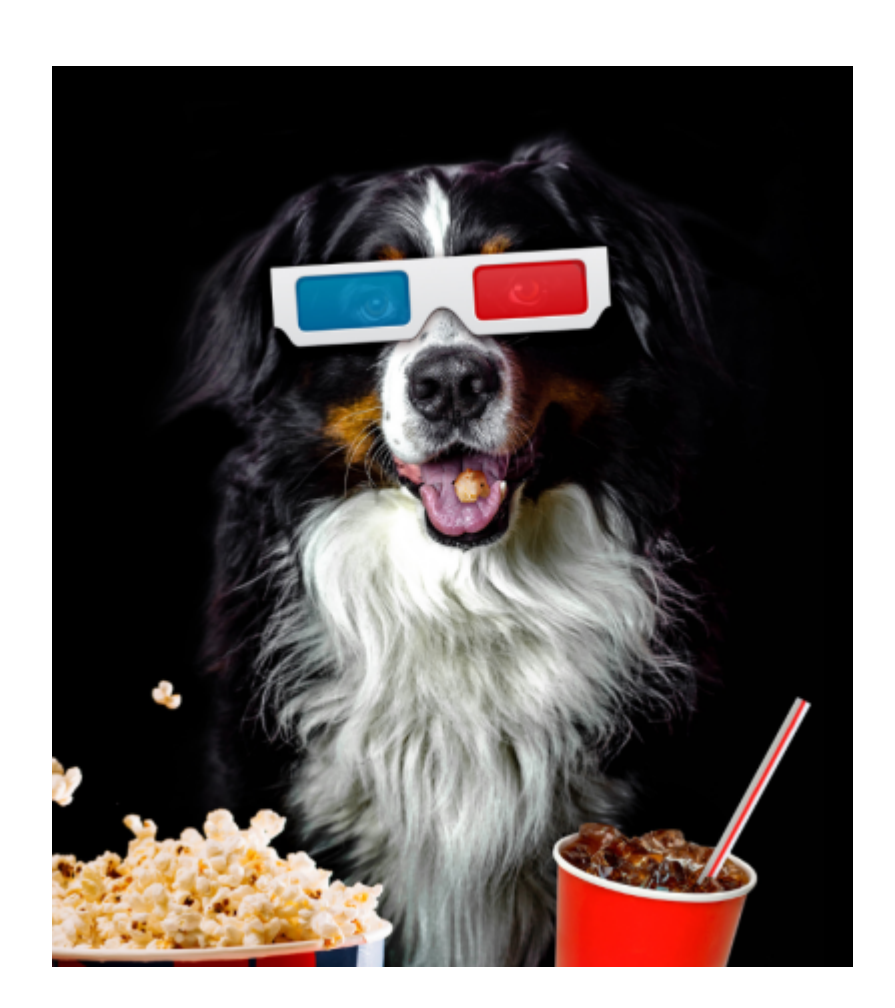
Dog Friendly Movie Matinee