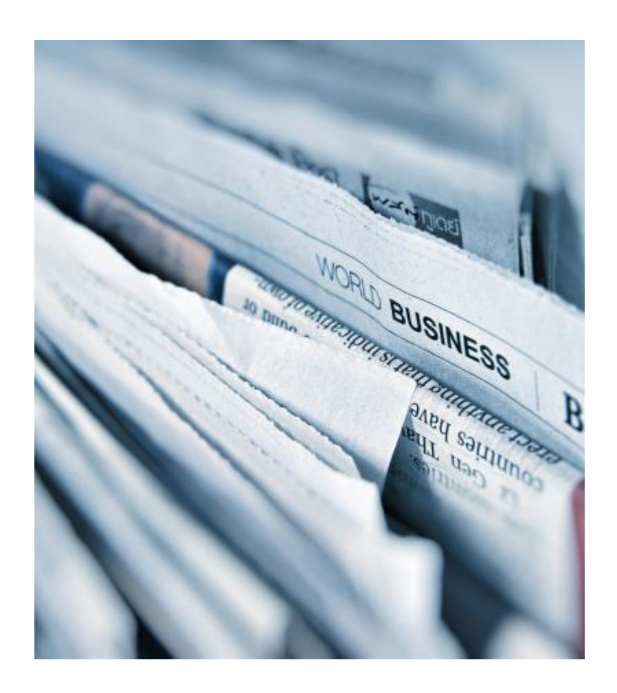
Arts Programming in a Public Library, Part I