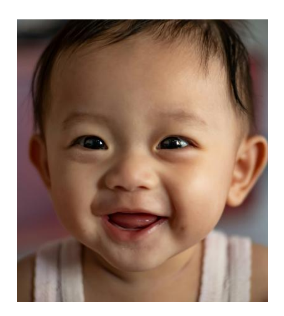
Taking Care of Us