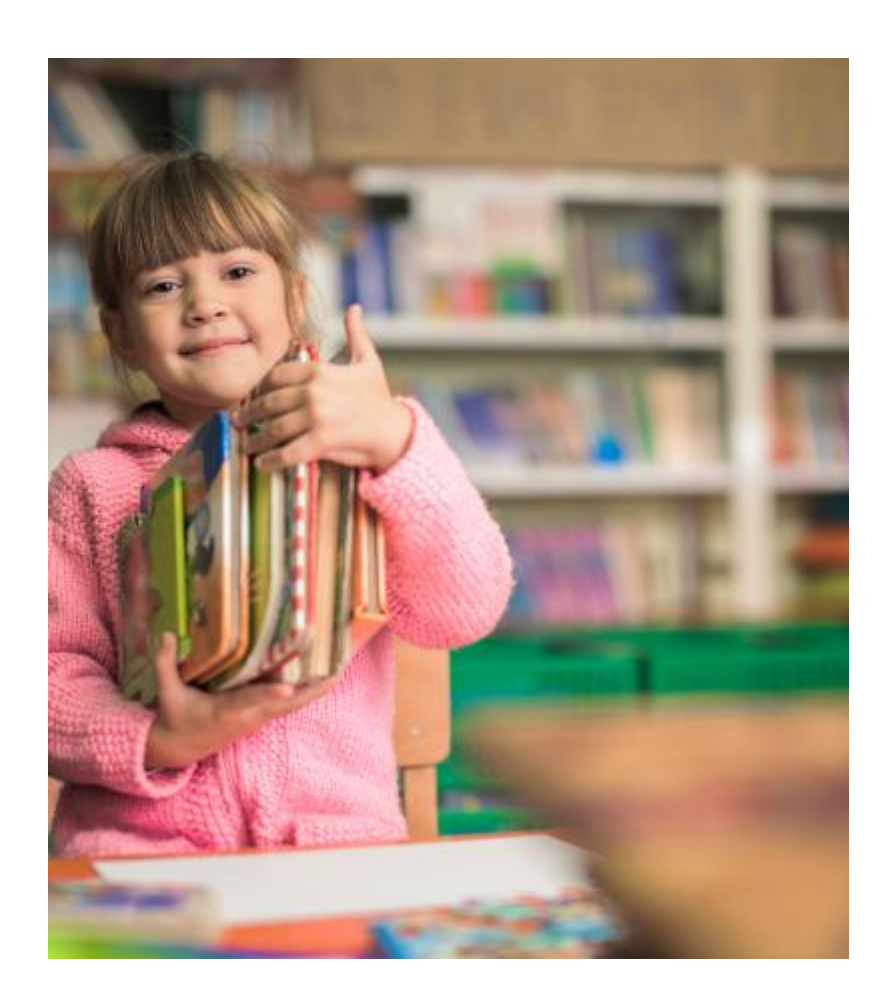
TRY Fayetteville Public Library