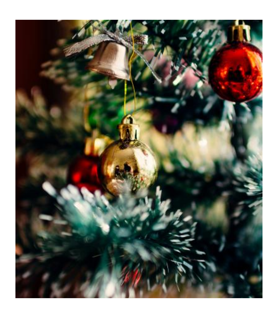
Rural Roots: Holiday Tradition