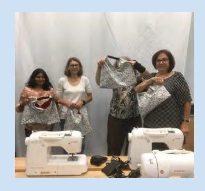
Origami Market Bags