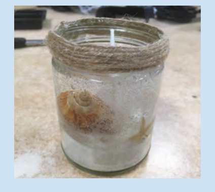
Beach Jelly Candle