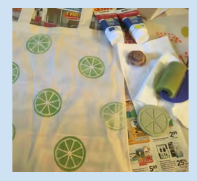
Fabric Block Printing