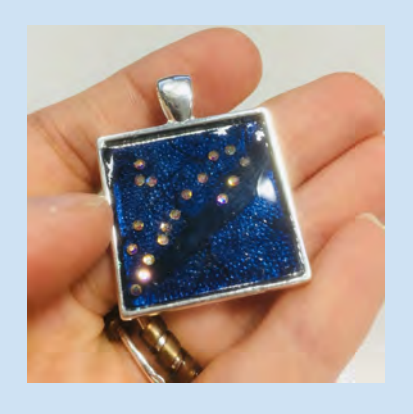
UV Resin Constellation Pendant