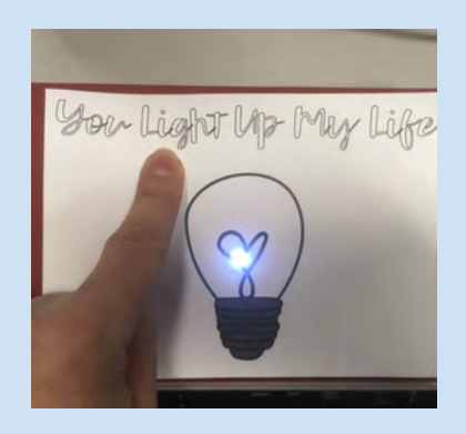
LED Greeting Card