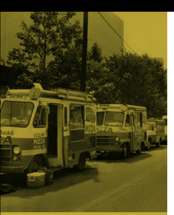
Temple food trucks, 1976