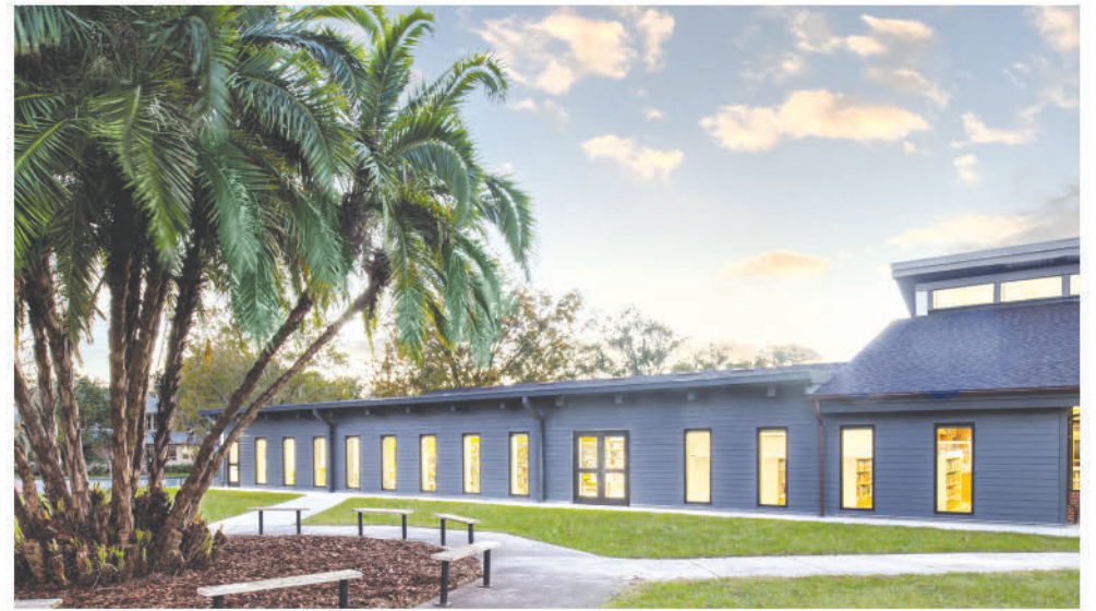
In 2022, the Tavares Public Library completed a 2500-square-foot expansion.

Dec. 12–22 – Drop-in Wrapping Station. Bring your own wrapping supplies or use some of ours, while supplies last.