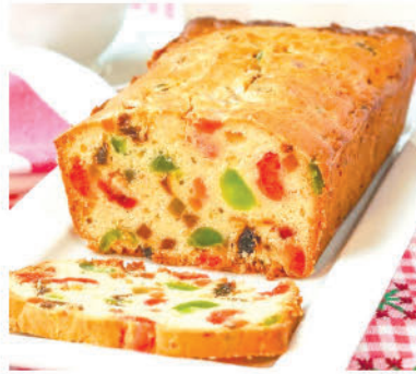
Dec. 9, fruitcake will be the featured topic in a fun, informational class.

Dec. 28 – Vision Board Class, 11 a.m. Prepare for the new year by making your 2024 vision board. All supplies provided. Supplies will be available between 11 a.m. and 2 p.m. Ideal for teens and adults. Registration is encouraged.