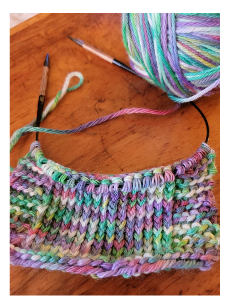
Knitted swatch of demonstration yarn to show how the yarn will look when it's used to make a garment.