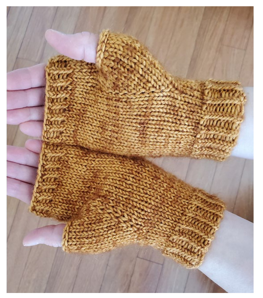
Participants learned how to knit, purl, and read a pattern to make these easy fingerless gloves.