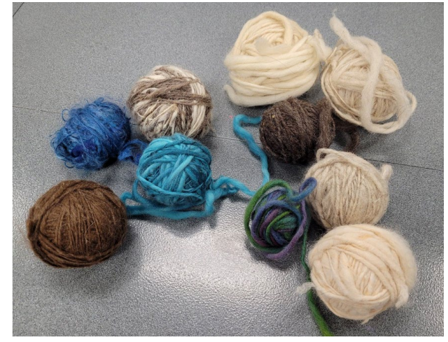
Examples of hand spun yarn.