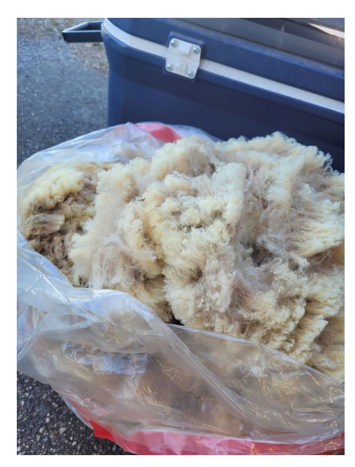
Fleece wool before being cleaned and processed for yarn. This is how wool looks when it is sheared off the sheep.