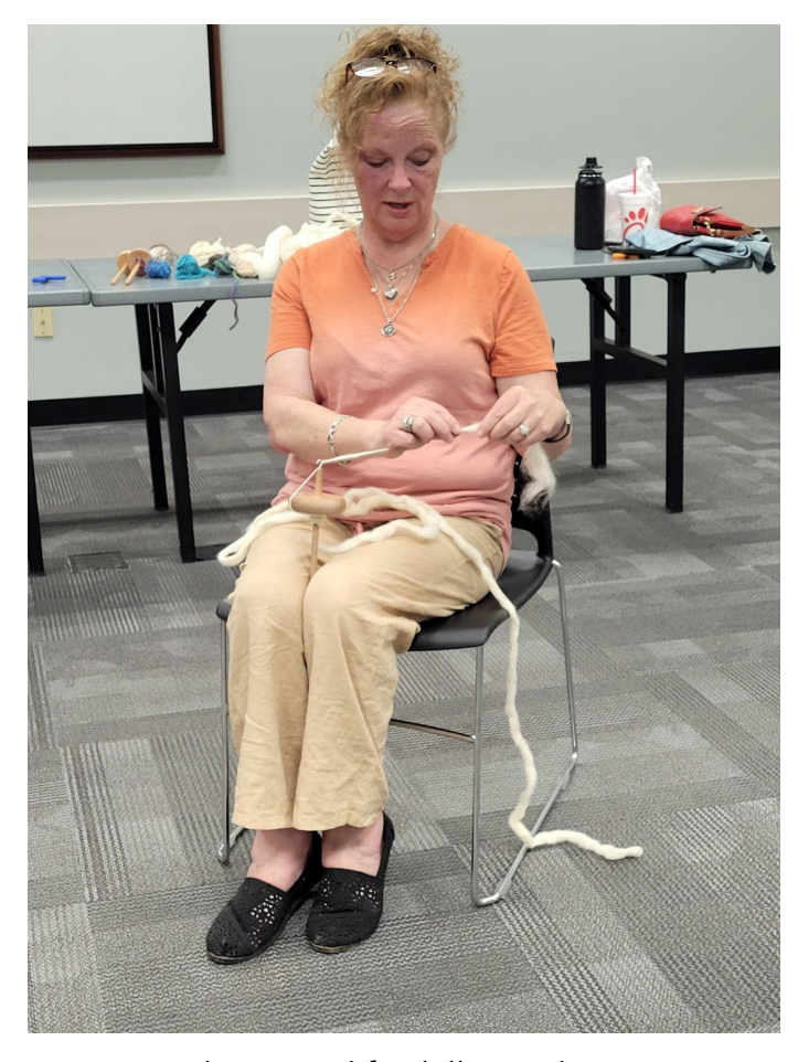
Our heritage life skills teacher demonstrating how to take roving wool and spin it into yarn.