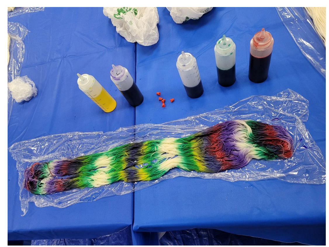
An example of each participant's station with the completed dyed skein of demonstration yarn.