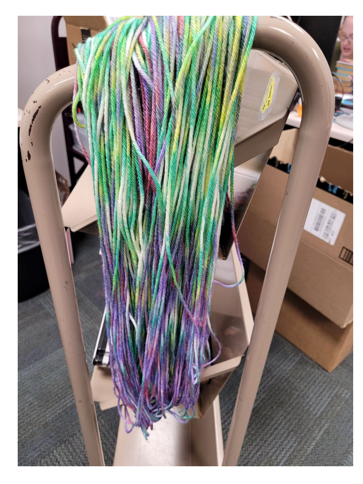
Demonstration yarn after being heat treated, rinsed, and hung to dry.