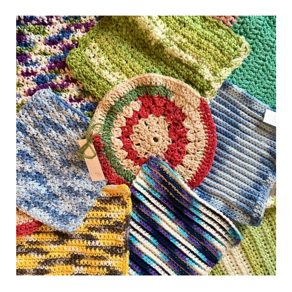
Examples of what participants could create from our basic crochet class.