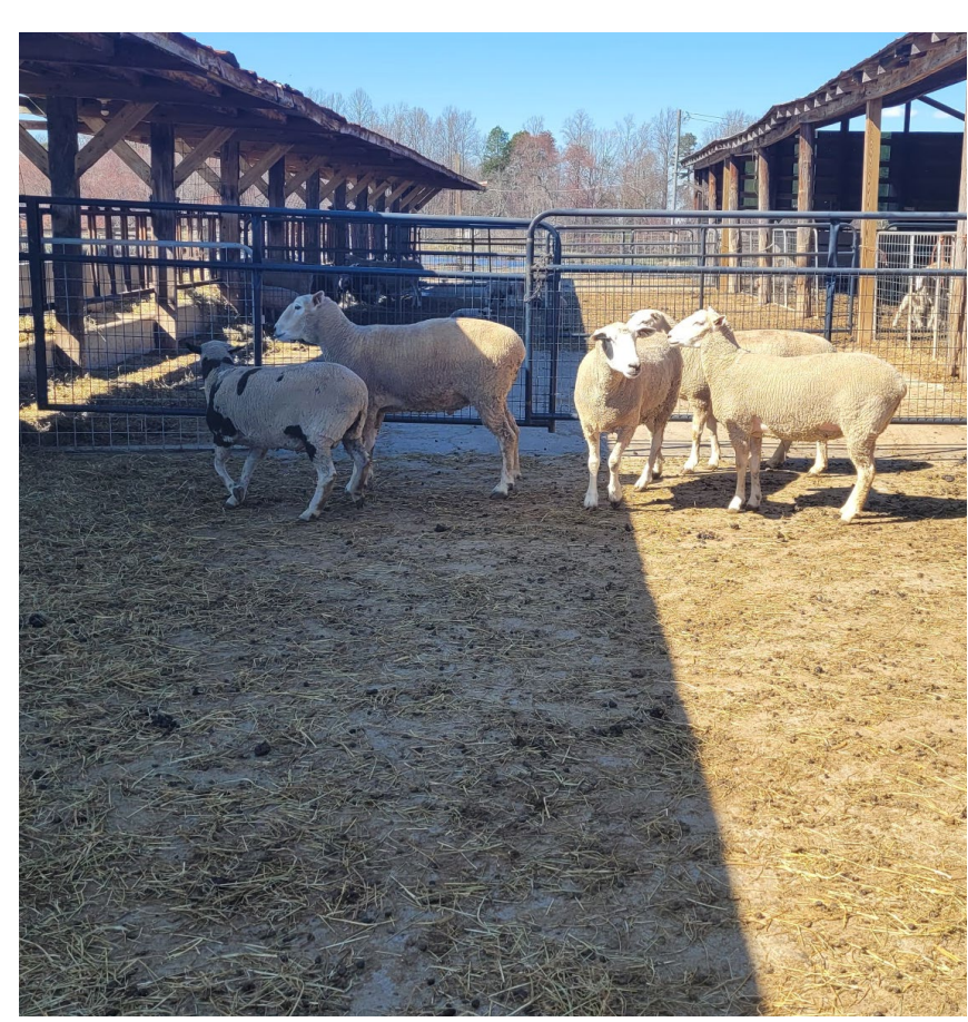
Everyone enjoyed visiting with the sheep and their lambs!