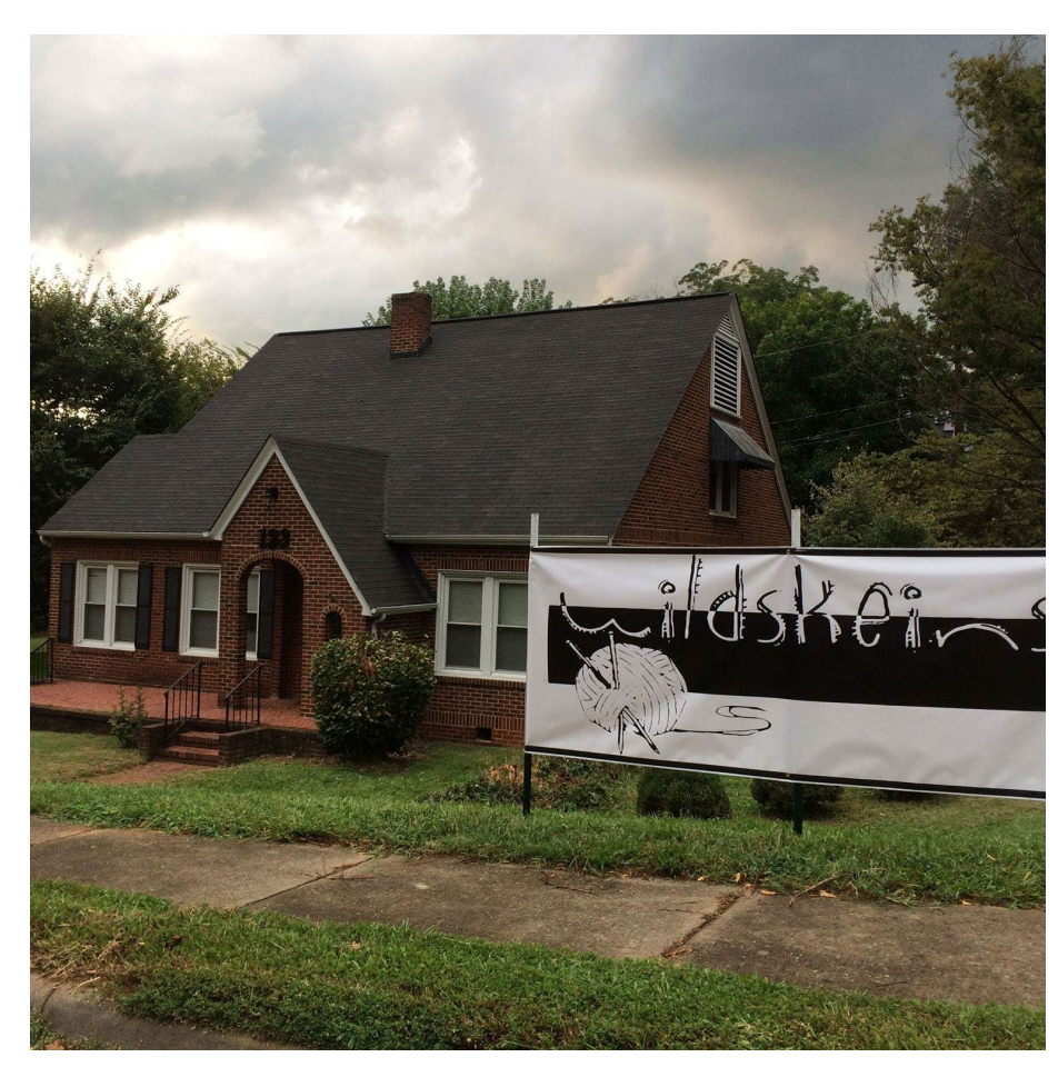
Our local yarn store, Wildskeins, who taught our knitting class and supplied the yarn for our dyeing class.