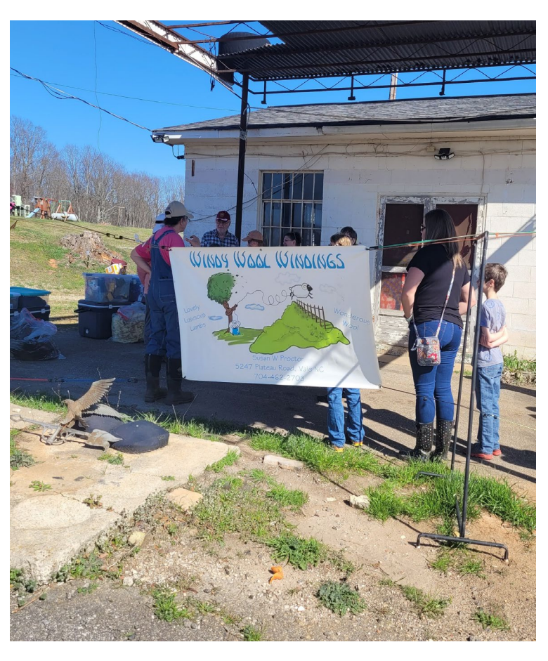
Participants learning about how fleece is processed into yarn.