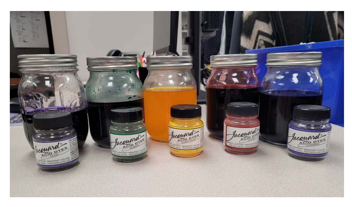
We used Jacquard brand acid dyes for this program. Acid dye is best used on protein based fibers. You need a measuring cup and food scale to create your stock solution. Because they are acid based, I also used an N95 mask when I was working with the dye powder.