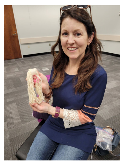
A participant showing off her hand spun yarn.