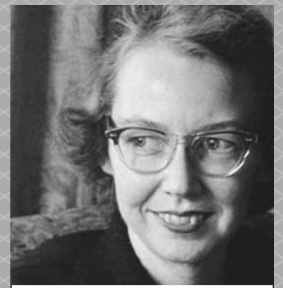
Flannery O'Connor May 14

All are welcome. No Stout purchase required. See reverse for story schedule.