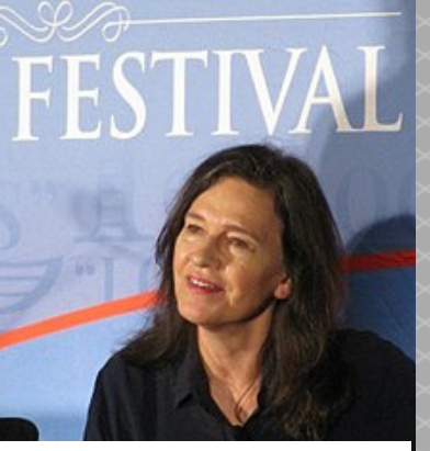
Louise Erdrich September 10