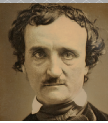
Edgar Allan Poe October 8