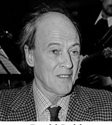
Roald Dahl August 13